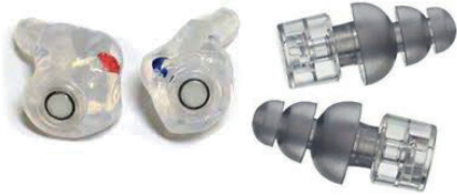
Figure 3. ER15 custom-made earplugs (left) and the one-size-fits-all ER20XS earplugs (right).

earplug that replaced most of the lost higher-frequency sound energy - the result was the world's first uniform attenuation (or flat) earplug. Low-frequency bass sounds, mid-frequency sounds, and higher-frequency sounds were all equally attenuated by exactly 15 dB. Figure 2 shows the uniform attenuation pattern for the ER15 for 50 people, along with the range for the right ear (red) and the left ear (blue). Except for one low-frequency outlier in the right ear, the attenuation pattern is rather consistent. The outlier may have been related to a measurement artifact where the measuring probe microphone may have caused a low-frequency leakage. Figure 3 shows a picture of the ER15 and its one-size-fits-all cousin, the ER20XS.